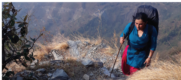
A VSP on the way to a remote Health Post with LARC supplies

Greater use could be made of mobile outreach service events: Experience shows that dedicated service days create excitement among women in the village. There is also a perception that external providers provide better quality services. Women travel together in groups, providing mutual support and encouragement but also increasing their safety. The camaraderie created encourages attendance by those who might otherwise be hesitant to attend.