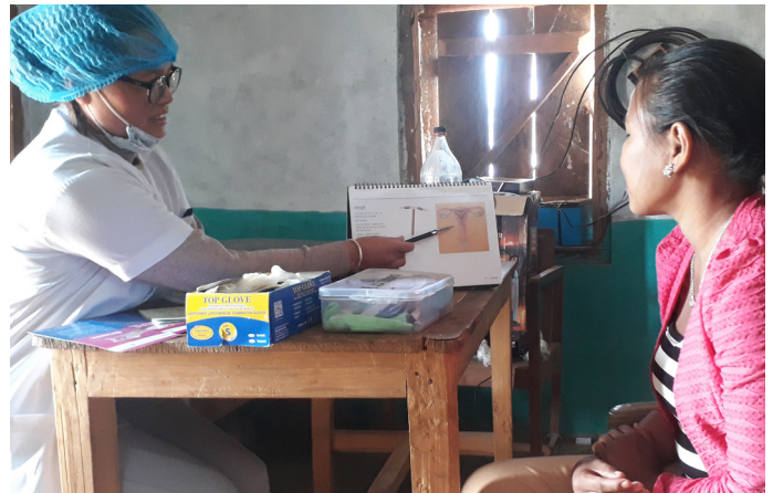
A VSP counseling a woman for LARC services at a Health Post

In low-resource settings such as Nepal, where very few family planning (FP) service providers have received competency-based training on LARC; and when those trained are mostly based at hospitals and in urban areas, the VSP model has immense potential to improve LARCs uptake. VSPs, as the name suggests, are trained providers who visit primary level health facilities as per planned schedules to deliver LARC services.